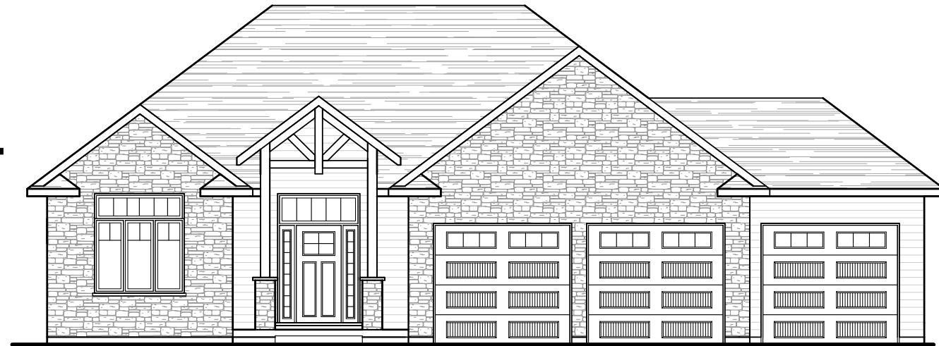
Optional Third Bay